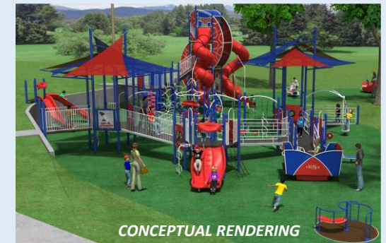
Proposition 3: Community Park Enhancements