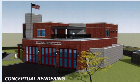
Proposition 2: Public Safety