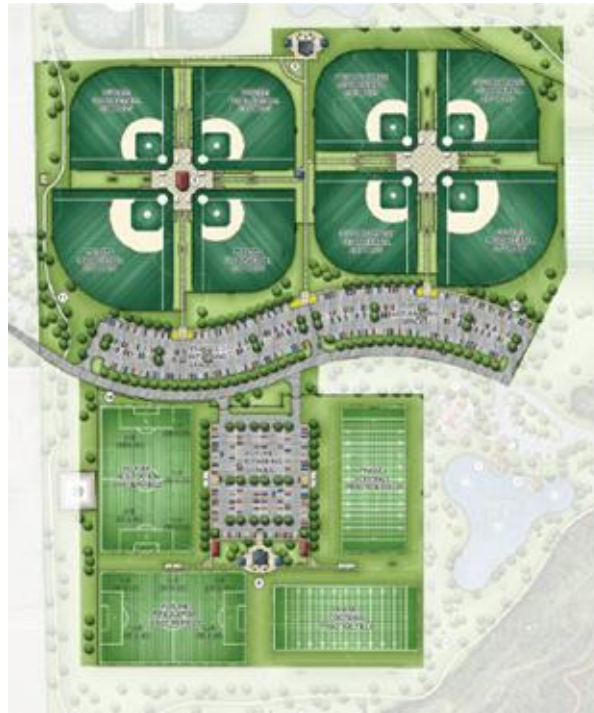
Proposition 6: Youth Sports Complex